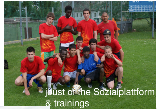
host of the Sozialplattform & trainings