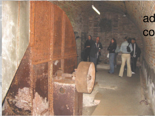
adit hike – an exemplar of contemporary history