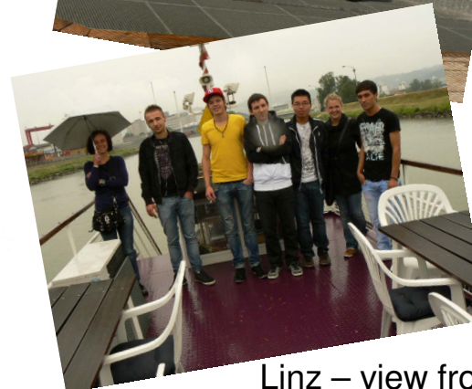
Linz – view from the Danube shipping on the MS Helene