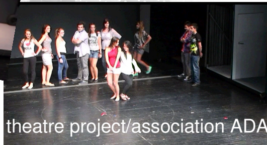
theatre project/association ADA